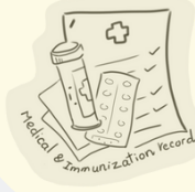
Medical & Immunization Records