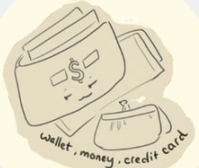
Wallet & Money