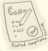
Printed Compliance Course