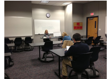
DASS Room 217—test proctoring area

Please remember DASS is not able to proctor exams that are administered on a computer , unless the student has the accommodation that requires a word processor for a writing intensive test.