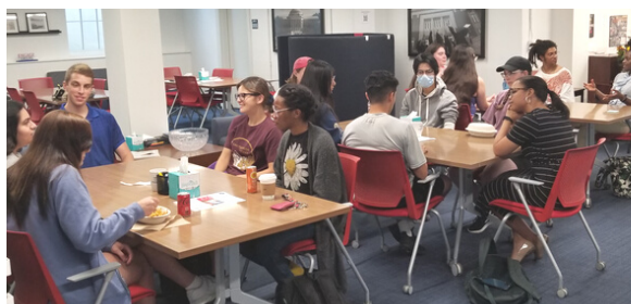
"Real Talk" lunch session about imposter syndrome