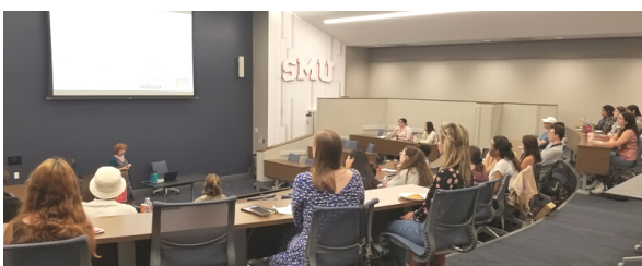
Summer Research & Innovation Symposium