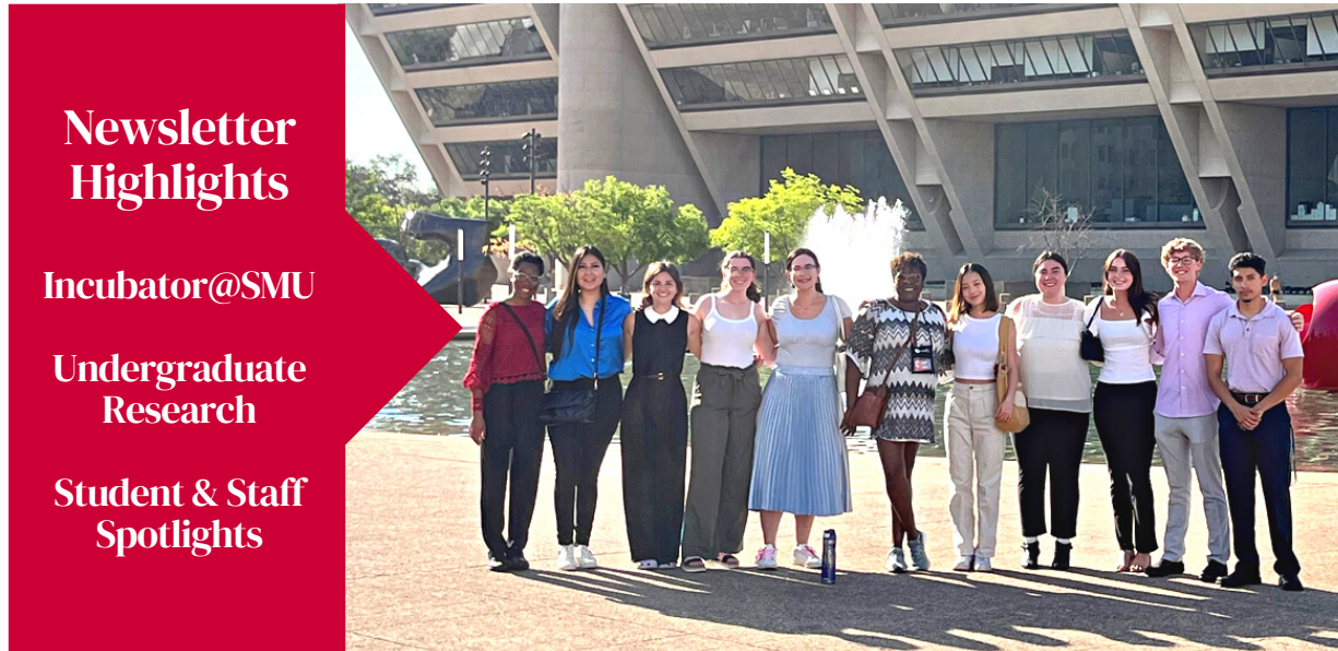
REU students, from SMU & 8 other universities, on a field trip to Dallas City Hall. Read more on p. 3