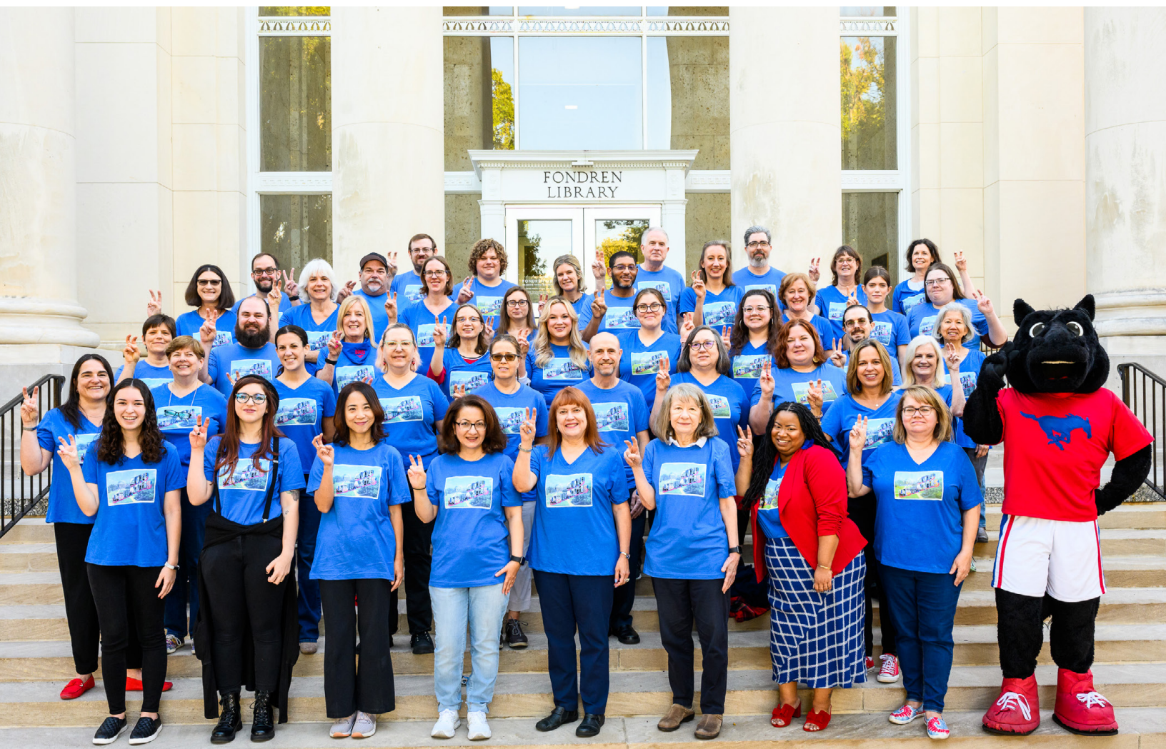
Peruna joined SMU Libraries staff to kick off Homecoming Weekend on the steps of Fondren Library.