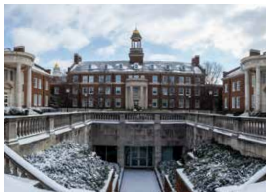
Snow and ice lingered on campus and across the state due to days of below-freezing temperatures.

Several inches of snow and a week of subfreezing temperatures in February temporarily halted travel and commerce across much of the state, including Dallas. SMU canceled classes for five consecutive days, Feb. 15-19. The single-digit temperatures resulted in power outages and frozen water pipes in some campus buildings. Although the storm wreaked havoc, it also made for some memorable campus images, as captured in these photos.