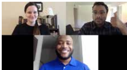
Net Impact members recorded videos encouraging Girl Scouts to earn the new civil engagement badge.