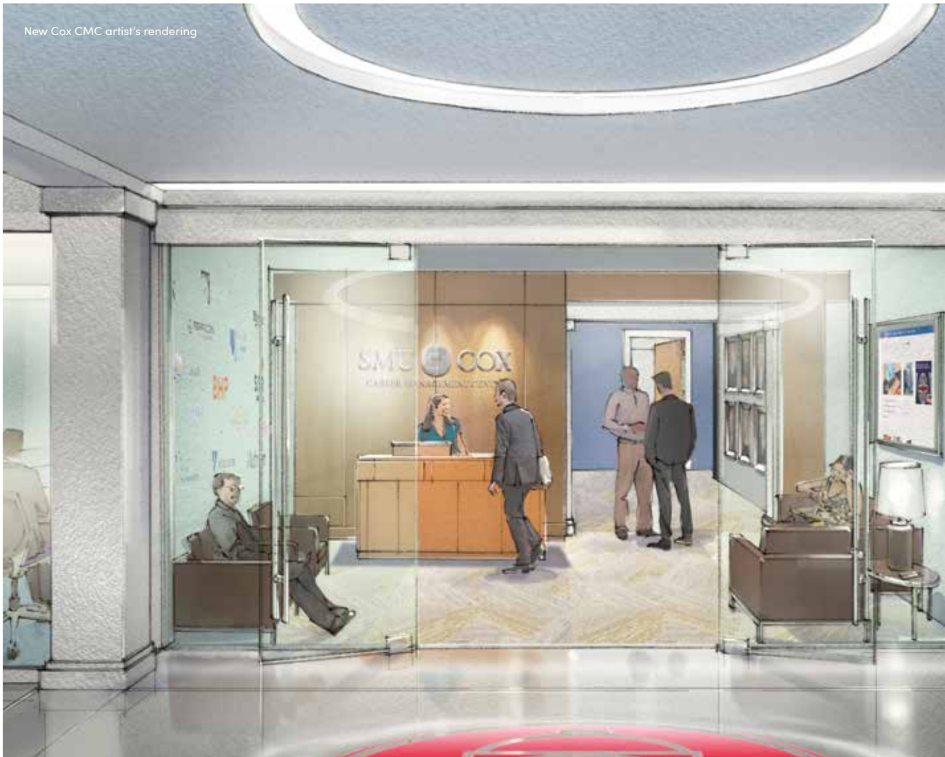
New Cox CMC artist's rendering

“OUR INTENT IS TO PROVIDE SPACES WHERE PEOPLE CAN FEEL A SENSE OF PRIVACY WHILE ALSO FEELING CONNECTED TO THE HEARTBEAT OF COX.”