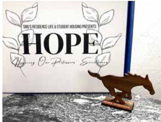
SMU Cox faculty and adjunct faculty members were nominated for the 2021 Honoring Our Professors’ Excellence (HOPE) Award.