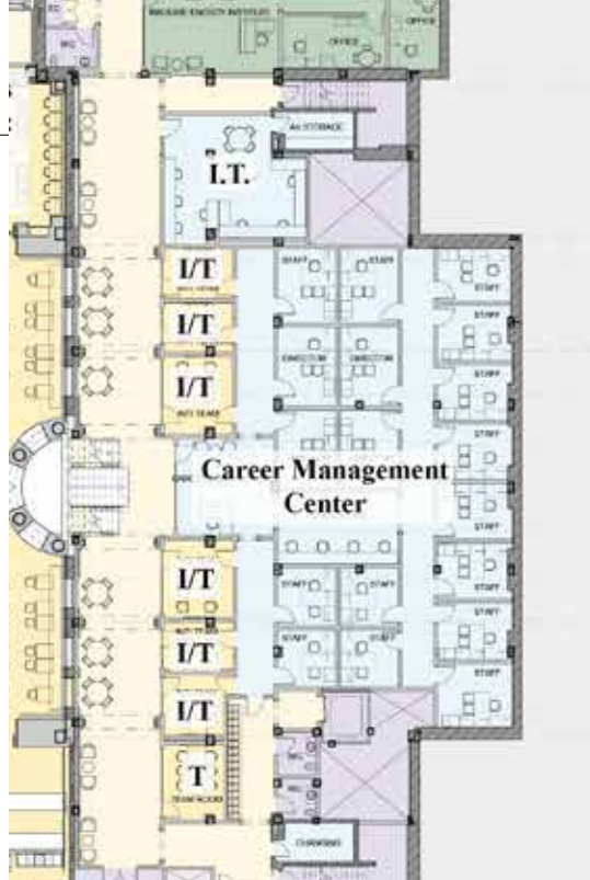
The plans for the new Career Management Center area call for it to cover more than 6,600 square feet.

“WE WANT TO BE ABLE TO ROLL OUT THE RED-AND-BLUE CARPET HERE AT COX AND GIVE THEM AN EXPERIENCE THAT IS AS GOOD AS, IF NOT BETTER THAN, ANY OTHER TOP BUSINESS SCHOOL IN THE COUNTRY.”