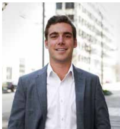
Cameron Police, 2021 Best & Brightest BBA