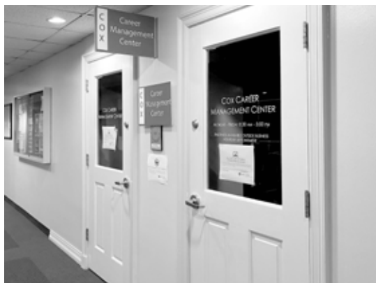
Photo at right shows the existing entrance of the Cox School’s Career Management Center. The new CMC will feature a front entrance with glass walls for a more open look.