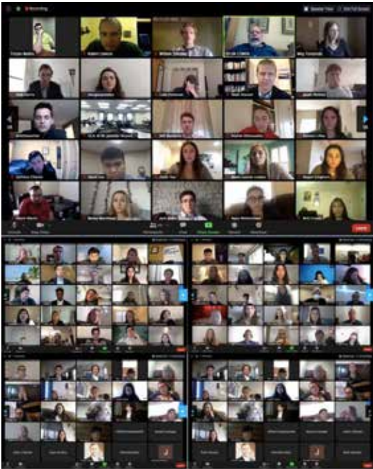
More than 100 students from five schools attended a Reading Group summit.