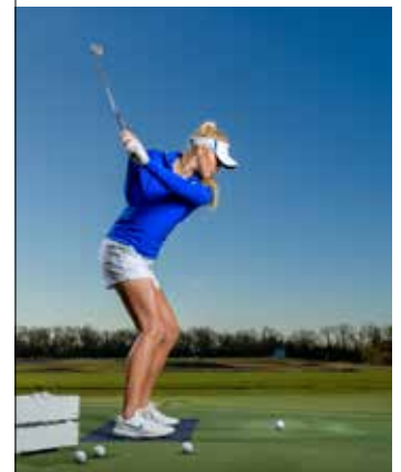
COVER ILLUSTRATION BY ELENA CHUDOBA

YOUR CONNECTION TO BUSINESS EXCELLENCE: DISCOVER MORE AT COXTODAY.SMU.EDU