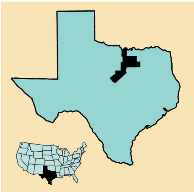
Fig. 1. Location map of study area in north-central Texas (USA).

of the carbon curve during the Cenomanian and Turonian stages, and because of radiometric control provided by dated ammonite zones in the Western Interior Seaway, this long carbon curve is anchored at the portion of the section where mosasaurs were undergoing their initial evolution and diversification. In addition, because the carbon curve is global in application and because the ammonites and their absolute dating are globally relevant for correlation, the record of the earliest occurrences of mosasaurs and dolichosaurs (presumed close relatives of mosasaurs) can be compared across the Cretaceous world.