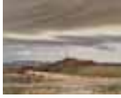
West Texas, Dusk , 1940