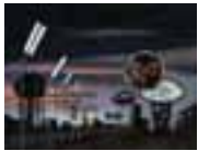
City Suburb at Dusk, 1978