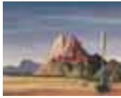
Chisos Mountains, 1937