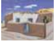
Adobe House in Taos, 1974