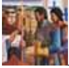
Padre and Spanish Soldiers , 1937

Dallas Museum of Art; Dealey Prize, Thirteenth Annual Dallas Allied Arts Exhibition, 1942; 1942.4