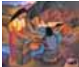
Mexican Women, 1933