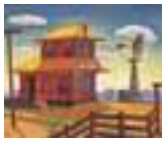
West Texas Railroad Station (Hovey) , 1934