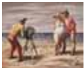
On the Beach at Galveston, 1941