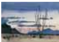
Arizona Desert, 1963