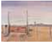
Ranch Gate , 1938