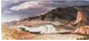
Where the Mountains Meet the Plains , 1939