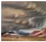
Rain Storm, Colorado , 1940