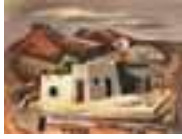
Houses in West Texas, Big Bend, 1941