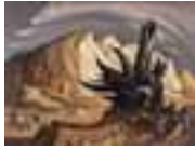
Century Plant, Big Bend, 1939