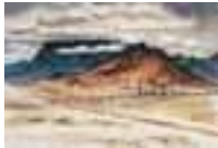
Ranch Near Tucumcari , 1946