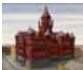
Dallas County Courthouse, 1936