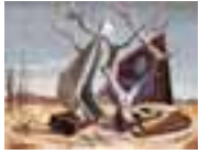
On the Ranch , 1941