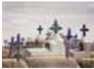
Terlinqua Graveyard , 1937