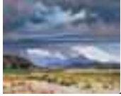
Near Chama, New Mexico, 1955