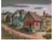
Green House in Cripple Creek, 1939