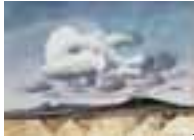
Near Abiqui, 1968