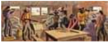
The American Buffalo Hunter at Adobe Walls, 1939