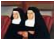
In the Chair Car, 1934