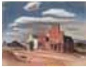
The New Highway Passed 'em By , 1938

Panhandle-Plains Historical Museum, Canyon, Texas