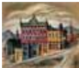
Old Buildings, Leadville, 1946