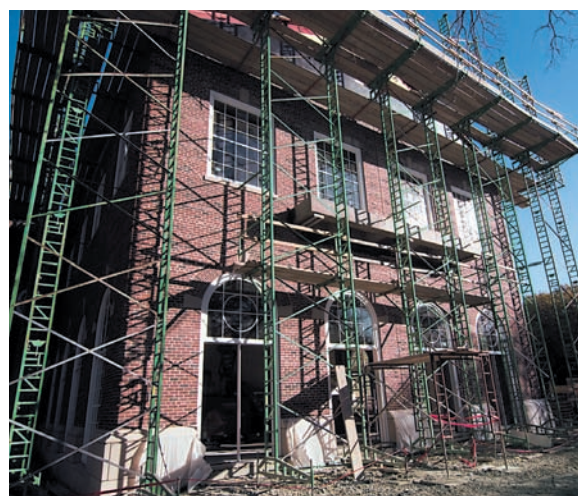
With the new Elizabeth Perkins Prothro Hall and renovations to Kirby and Selecman halls, the Perkins School of Theology will be well-equipped to prepare students for church leadership in the 21st century.

"Together with the hall renovations, the