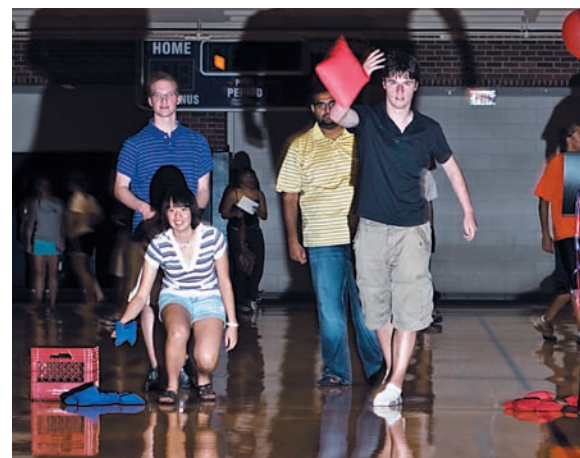
Students participate in a beanbag toss during SMU Gladiators, one of the new late-night events on campus that offer opportunities to gather and relax.