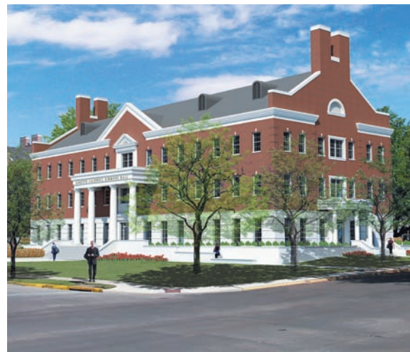
By supporting the construction of Annette Caldwell Simmons Hall, donors can honor the teachers in their lives with named rooms.

"One of the ways we will complete funding is to ask people to step forward to name every room