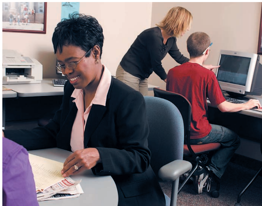
Counselors at the Hegi Family Career Development Center offer students and alumni guidance and workshops on interviewing, networking, résumés and more.