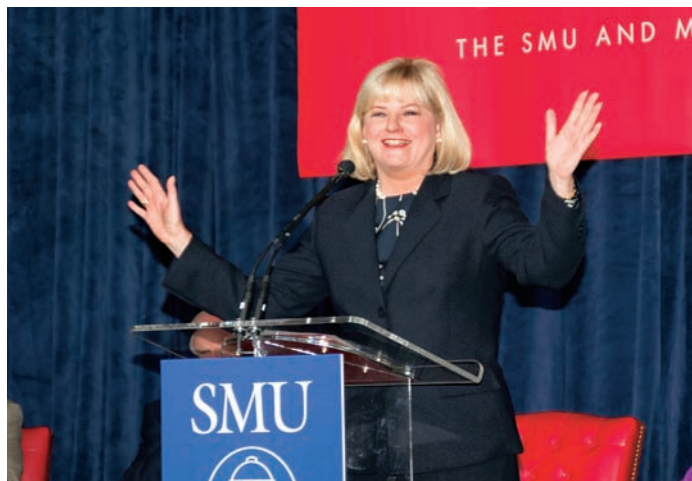
Announcements during the quiet phase include the historic $33 million gift from The Meadows Foundation.

The Second Century Campaign will officially launch September 12, 2008, with a series of events on the Dallas campus, and later in locations throughout the country. Current plans call for the campaign to conclude in May 2013.