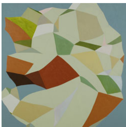
Hard Headed , 2007, Acrylic on Canvas, 63 3/4" x 63 3/4"