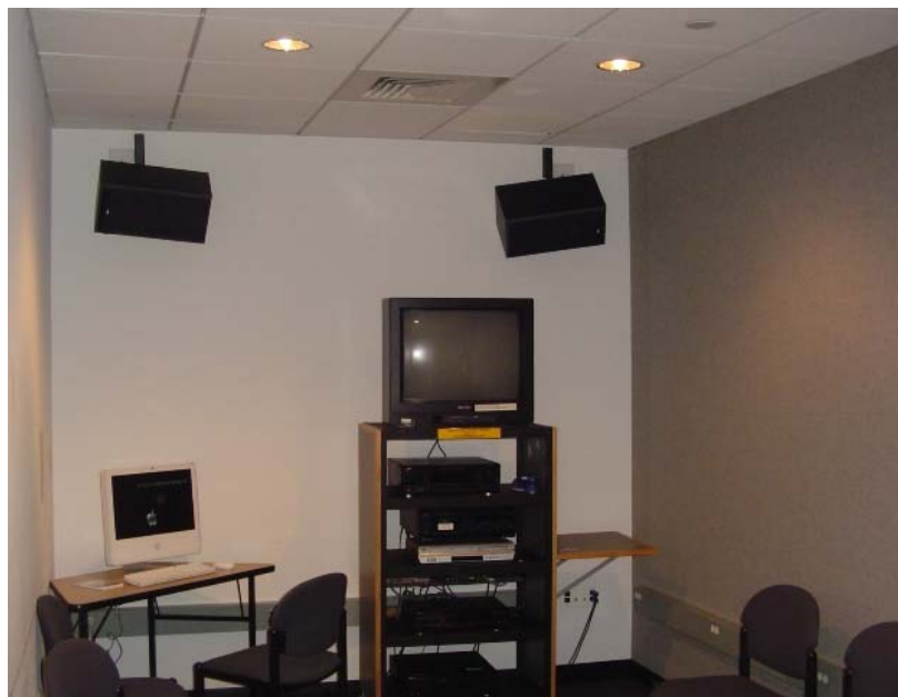
Hamon Group Listening Room B240

It is the task of any academic library to support the needs of the curriculum and, as much as possible, provide resources that students and faculty need or desire to get the most out of their programs. In this interest, the Hamon Arts library has teamed up with Meadows School of the Arts to improve our facilities for listening and audio editing on campus. There were already sound proof study rooms in the audio-visual center that needed a little sprucing up to bring them up to 200x standards. These rooms are B230 and B240, known as group listening rooms. The rooms are now equipped with integrated speakers and computer terminals to support the media needs of this and