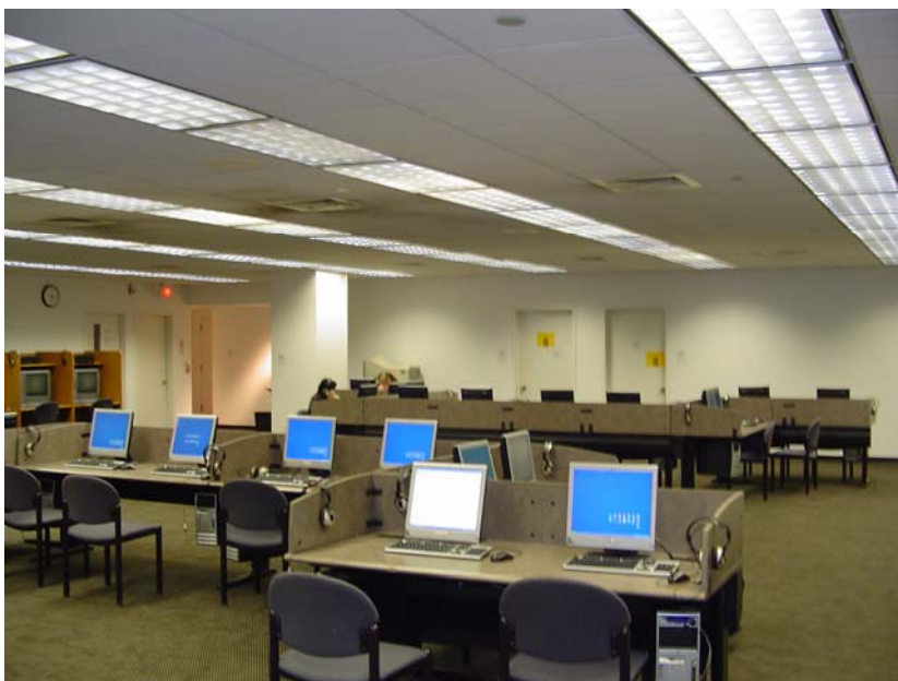
The Hamon Basement Now:

In the middle of the room is a large space where we will be putting comfortable “lounge” type furniture for patrons to come and take advantage of our wireless internet access. It also provides us with room to grow as the demands of our patrons grow.